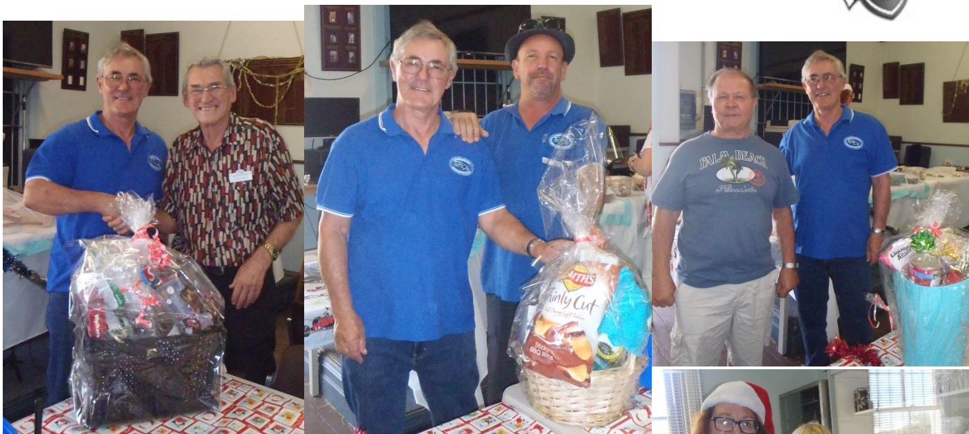
The VAA Xmas party of 2019